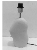
B BASE (1PC)