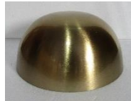
B (SHADE) (1PCS)